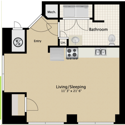
STUDIO B 428 SQ. FT.