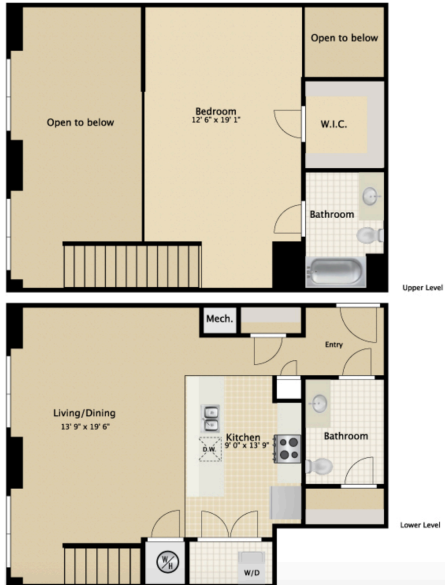
ONE BR- TOWNHOUSE A 1020 SQ. FT.