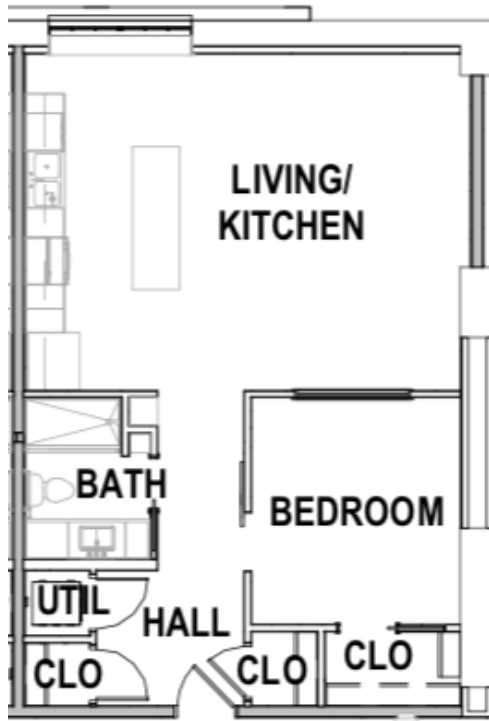
ONE BEDROOM / ONE BATH