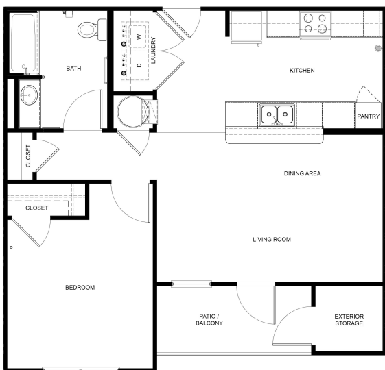
One Bedroom • One Bath 676 sq. ft.

$ _____ Rent $ _____ Security Deposit $ _____ Application Fee